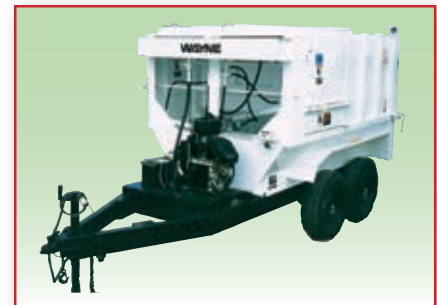
PUP trailer with gas or diesel engine

WAYNE ® ENGINEERED FOR PERFORMANCE www.WayneUSA.com